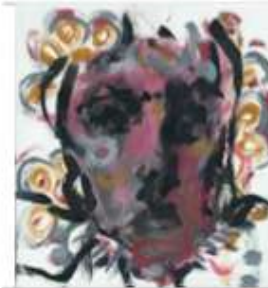
Dis Net Ek / It's Just Me XI Oil on board 18.5 x 19.2 cm Unframed R2,150