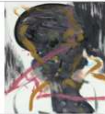
Dis Net Ek / It's Just Me VIII Oil on board 18.5 x 19.2 cm Unframed R2,150