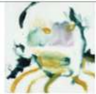
Dis Net Ek / It's Just Me IV Oil on board 15 x 15 cm Unframed R1,850