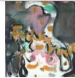
Dis Net Ek / It's Just Me X Oil on board 18.5 x 19.2 cm Unframed R2,150