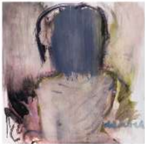
Maybe It's Just Me II Oil on board 69 x 68.5 cm Unframed R6,450