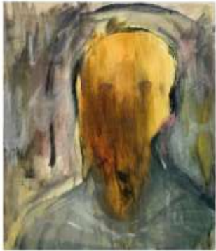
Maybe It's Just Me I Oil on board 60 x 68.5 cm Unframed R6,250