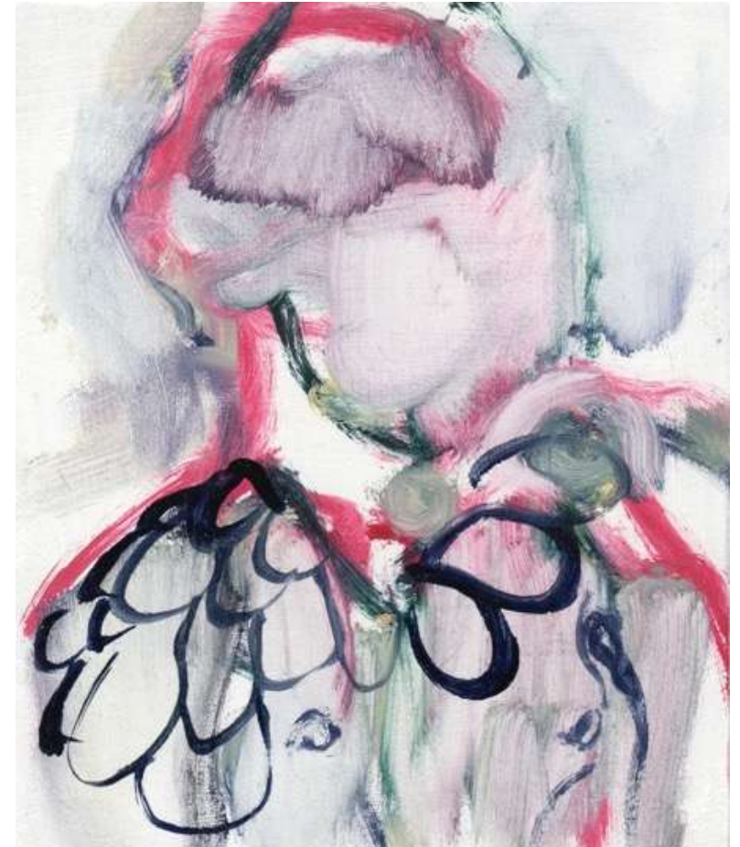
Dis Net Ek / It's Just Me

It was while painting this series that a short and rather persistent phrase kept appearing in the artist's mind; "dis net ek", "dis net ek". The Afrikaans phrase translates directly to "it's just me" and carries the same dual meaning. It could, on one hand, mean: "it's only me, I am on my own", or, on the other: "this is who I am, do you recognize me?". The hooded and somewhat monstrous figures mask their identities, yet it is with these masks that they exude a sense of vulnerability and innocence. In some way, the series evokes the childlike game of hide-and-seek. In the game, one child will close their eyes and count to 100 before shouting out "ready or not here I come!" with the aim to find the other players. As with the game, here each figure is trying to find one another whilst hiding only to slowly emerge in the hope to be found by saying "look, it's just me".