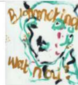
Dis Net Ek / It's Just Me XII Oil on board 18.5 x 19.2 cm Unframed R2,150