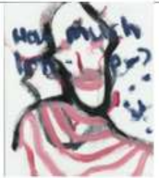
Dis Net Ek / It's Just Me III Oil on board 25 x 17.5 cm Unframed R2,400