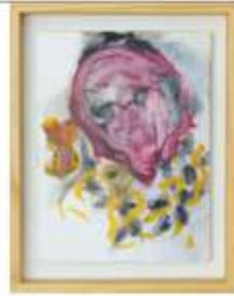
Dis Net Ek / It's Just Me II Oil on board 11 x 15 cm Framed R1,750