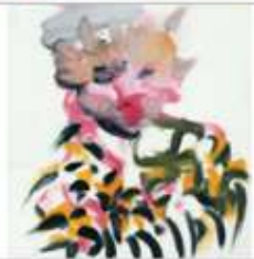
Dis Net Ek / It's Just Me VII Oil on board 18.5 x 19.2 cm Unframed R2,150