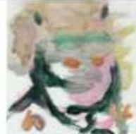
Dis Net Ek / It's Just Me VI Oil on board 15 x 15 cm Unframed R1,850