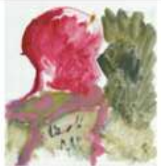
Dis Net Ek / It's Just Me V Oil on board 18.5 x 17 cm Unframed R2,100