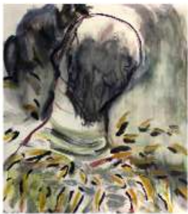
Maybe It's Just Me III Oil on board 60 x 68.5 cm Unframed R6,250