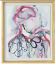
Dis Net Ek / It's Just Me I Oil on board 15.5 x 18.5 cm Framed R2,250